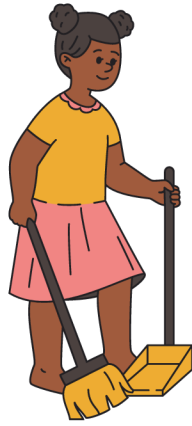
sweep the patio