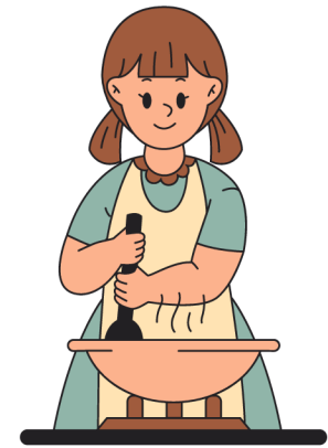
bake some treats