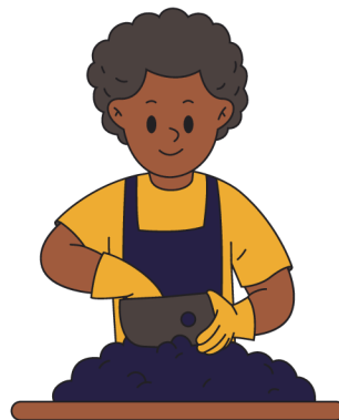
wash the dishes