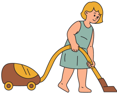
vacuum a room