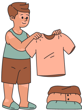
fold your clothes