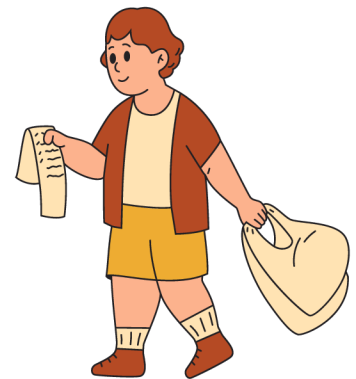
run an errand