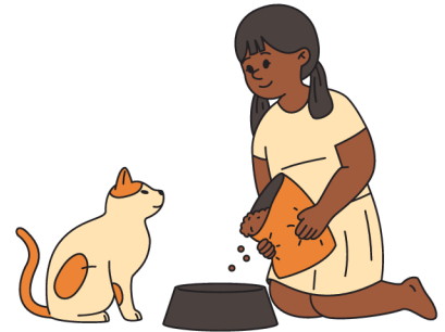
feed your pet