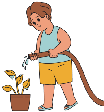
water the plants