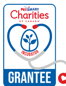
Incubator Grantee Badge