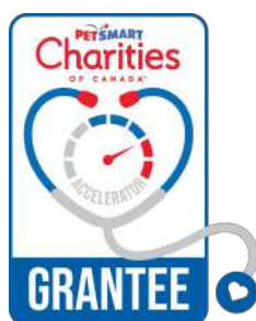
Accelerator Grantee Badge

Spread the news! Add the appropriate grantee badge to your email signature, social media posts and website. You may hyperlink the image to PetSmartCharities.ca to help raise awareness on the work we're doing together.