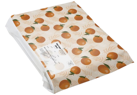
NEW! Variable Address Poly Mailers