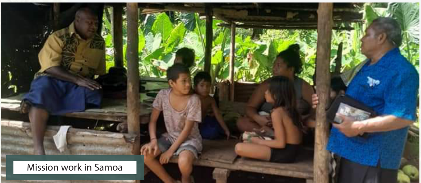
Mission work in Samoa